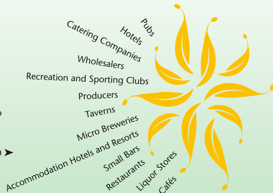
Exhibit to key decision makers from ➤

With over 2000 pre-registered attendees in 2009, Hospitality Expo attracts an involved and enquiring audience hungry for new ideas!