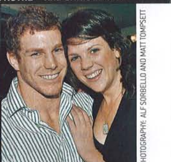
03 DAVID POCOCK AND EMMA PALANDRI